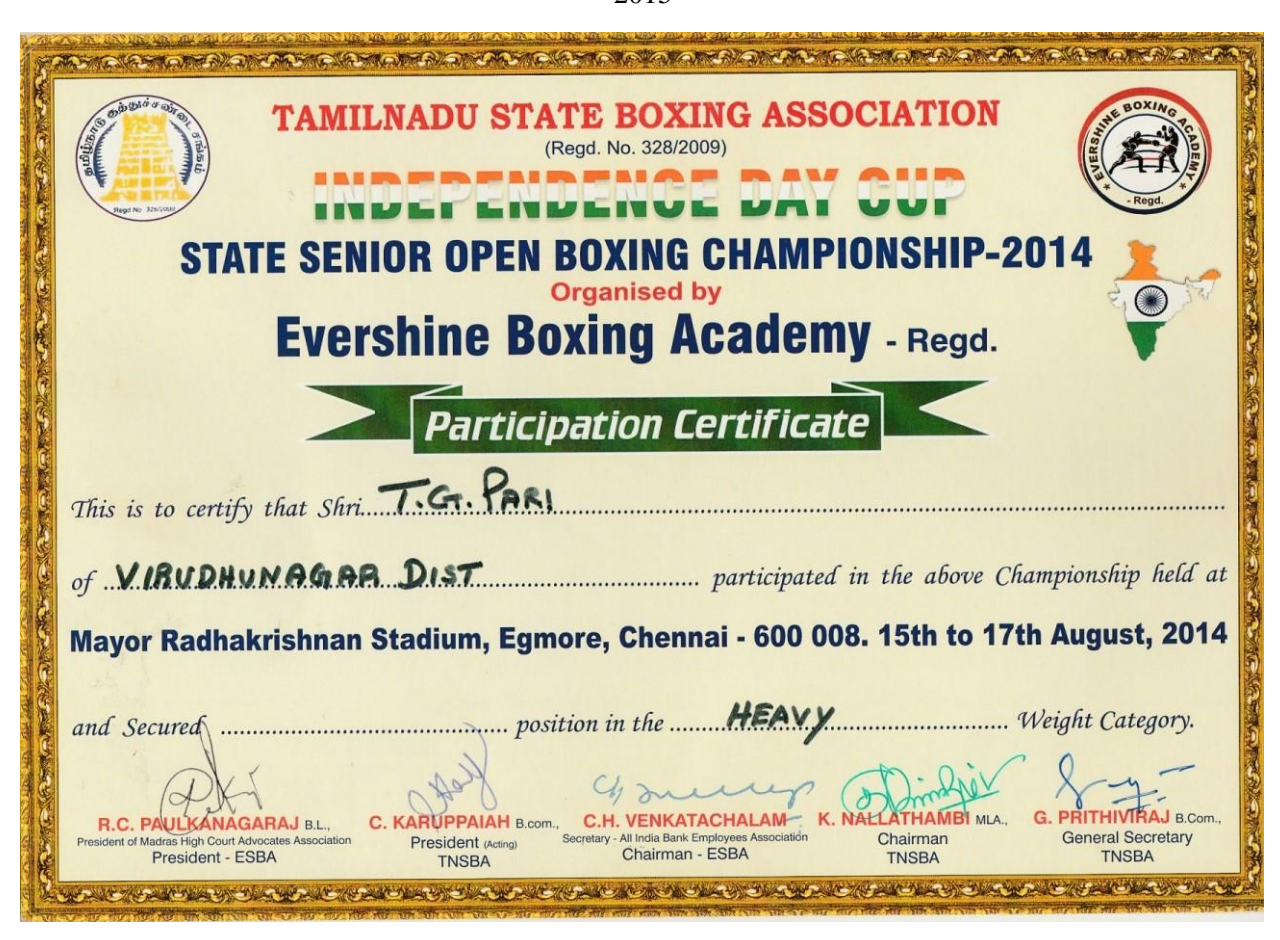
T.G. Pari, II EEE participated in State level senior open boxing championship-2014