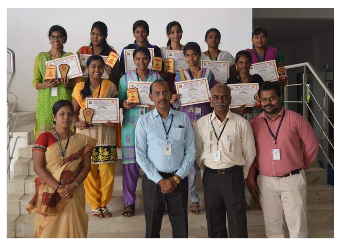
Our students secured first place in MOTO'17 cultural event organized by department of management, V.H.N.S.N. College, Virudhunagar