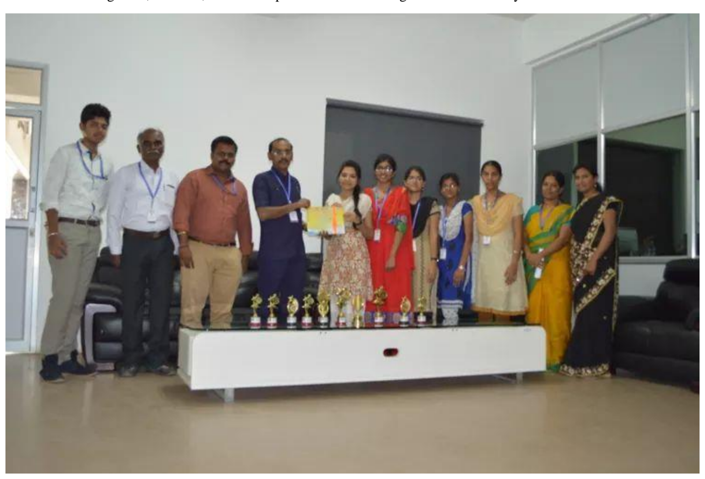
Our students secured first place in MOTO'18 cultural event organized by department of management, V.H.N.S.N. College, Virudhunagar