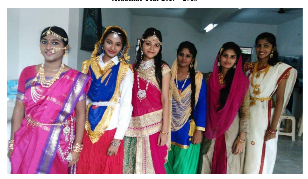
Our college students secured first prize in Fashion Show organized by Kolu Kondattam 2017, VPMM Group of Educational Institutions for Women on 27/09/2017