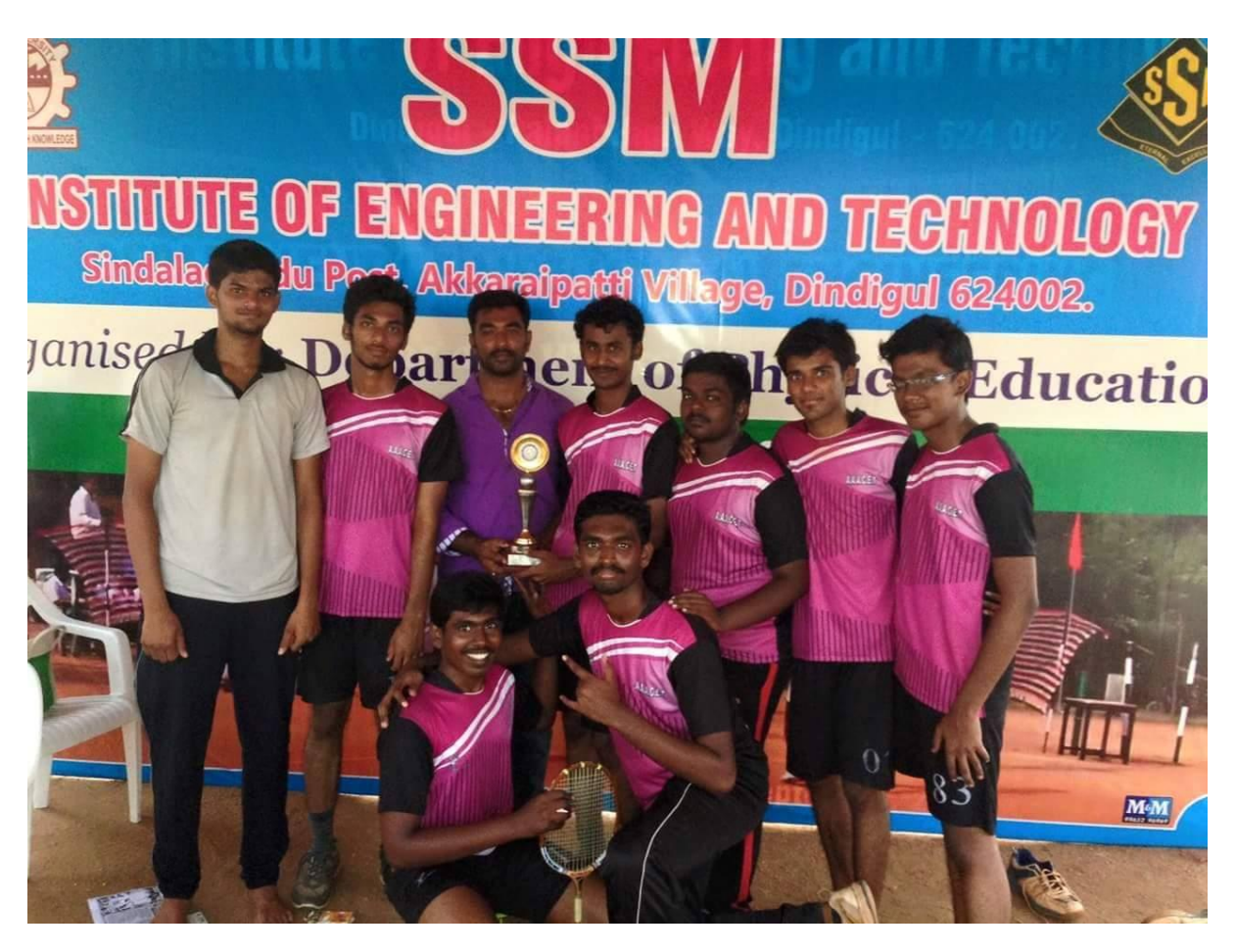
Men's Ball Badminton team secured 3rd place in Anna University athletic meet 2016 -17