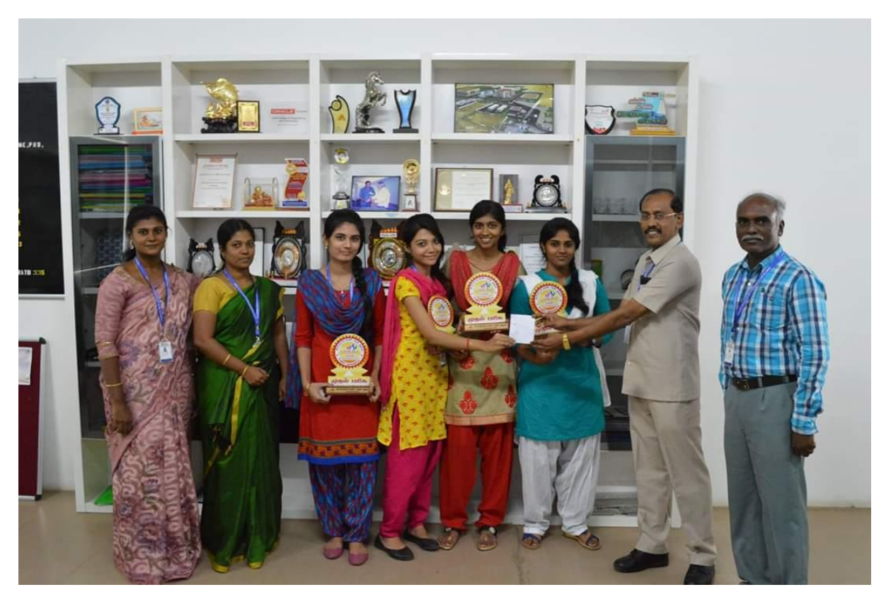
Our College Principal honoured the winners