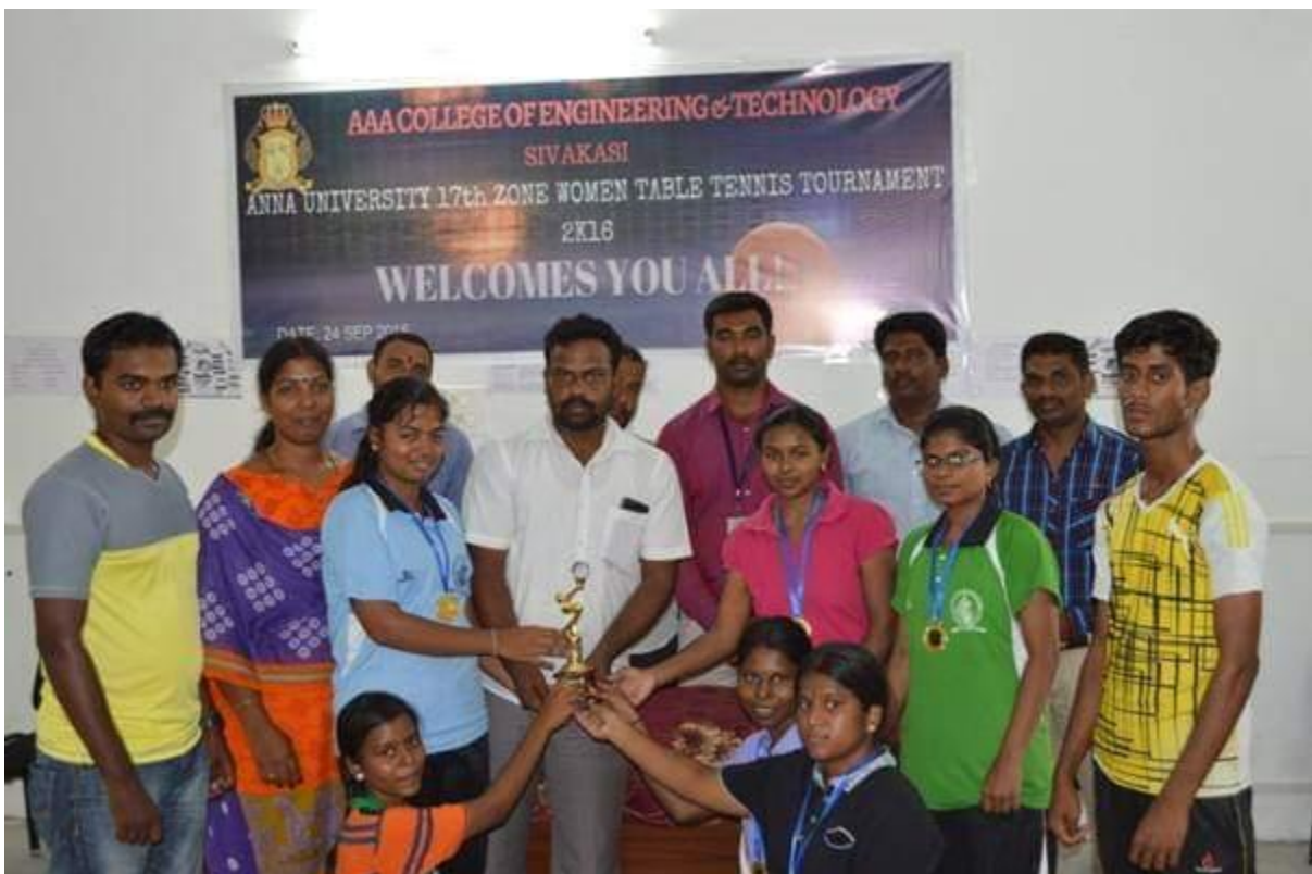
Winners honoured by Chief Guest