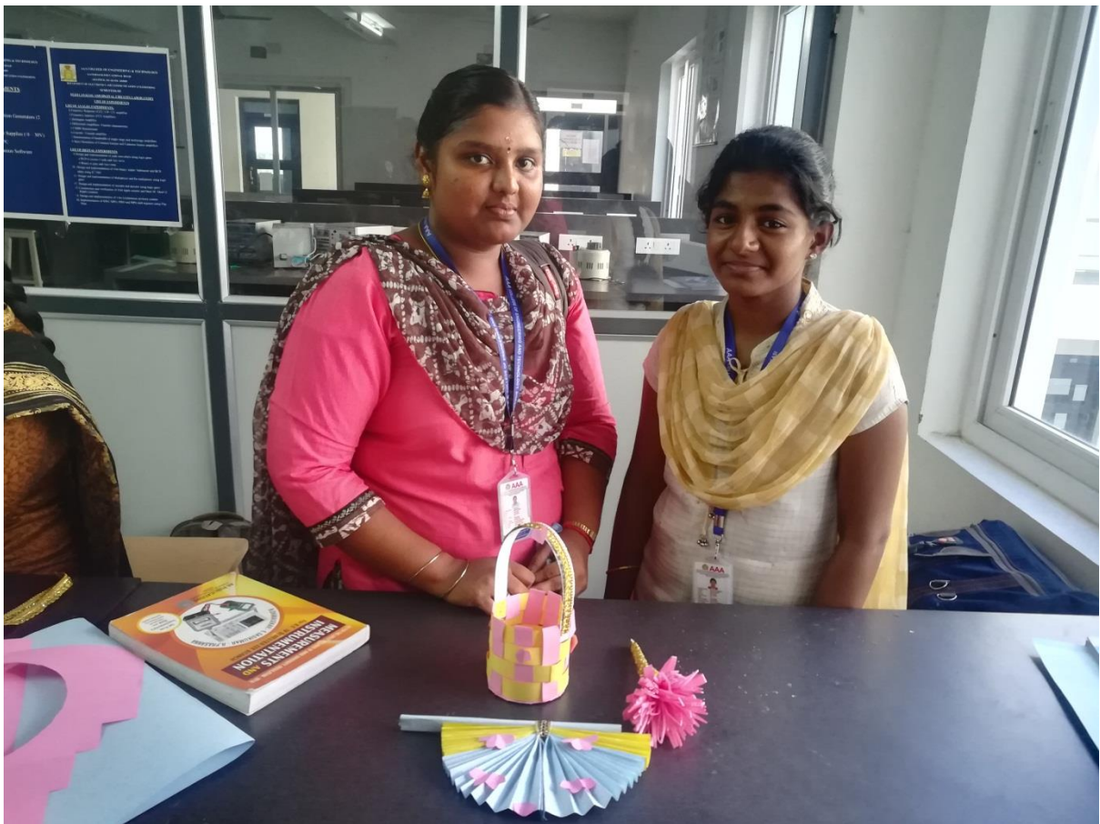
Art From Chart