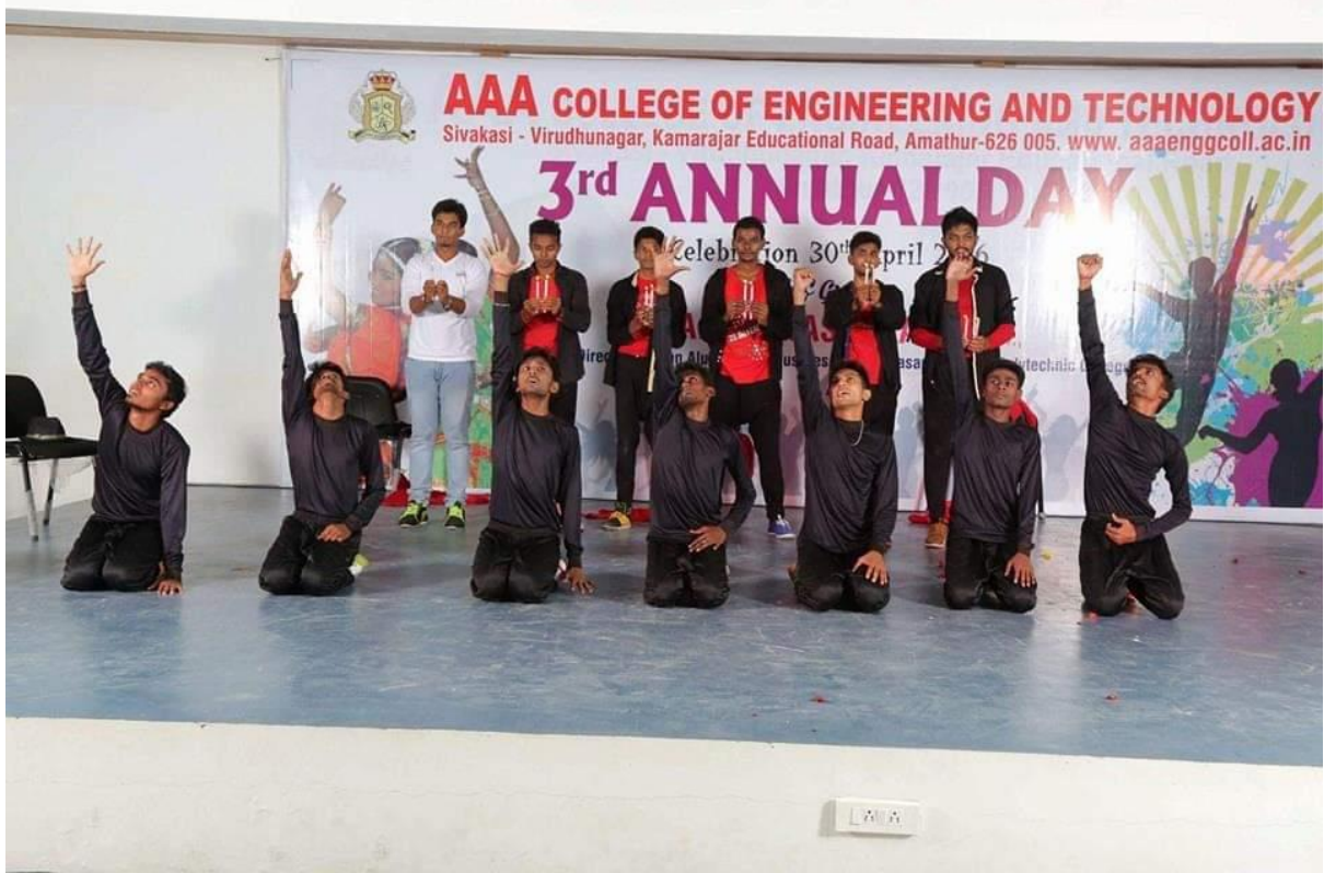
Annual Day Celebration