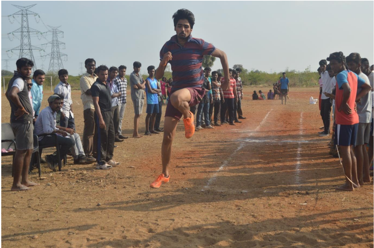
Sports Meet-Long Jump