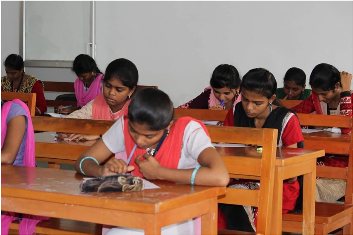
SONY FEST'16-Tamil Poetry