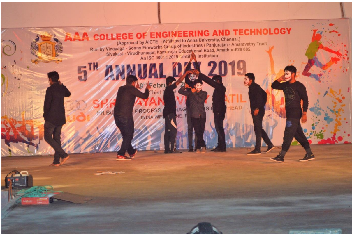
Annual Day celebration