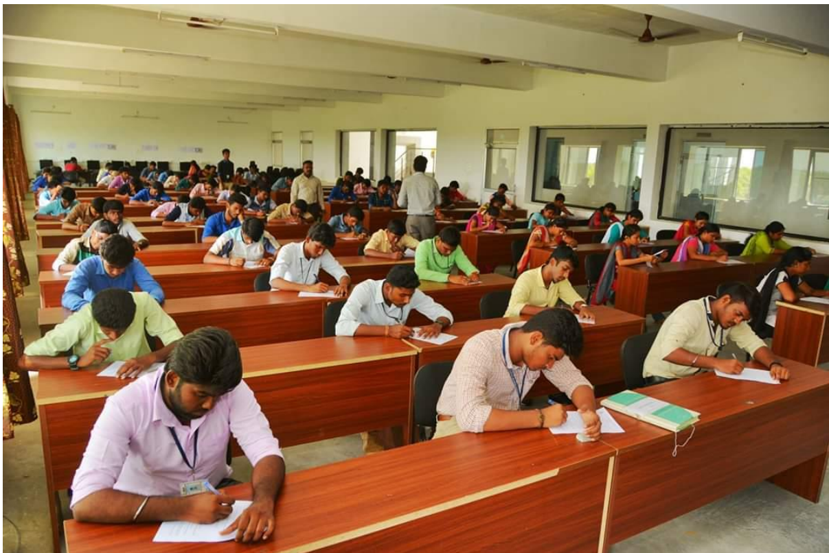
SONY FEST'17-Tamil Essay Writing