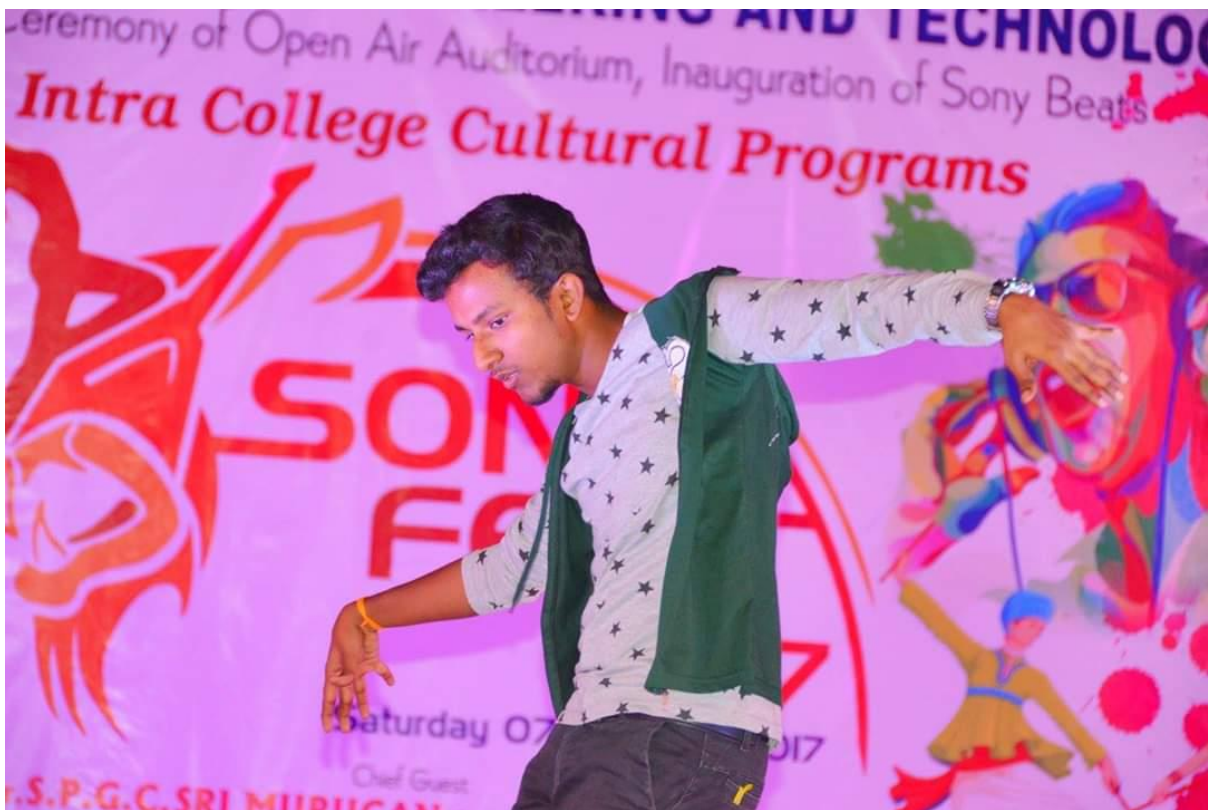
SONY FEST'16-Cultural Program