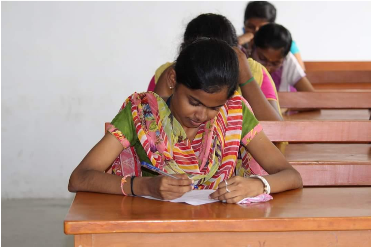
SONY FEST'16-Tamil Essay Writing