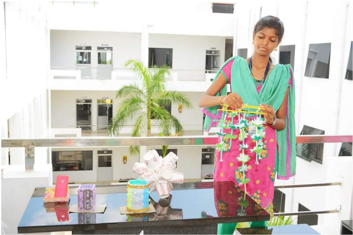
SONY FEST'17-Art From Waste