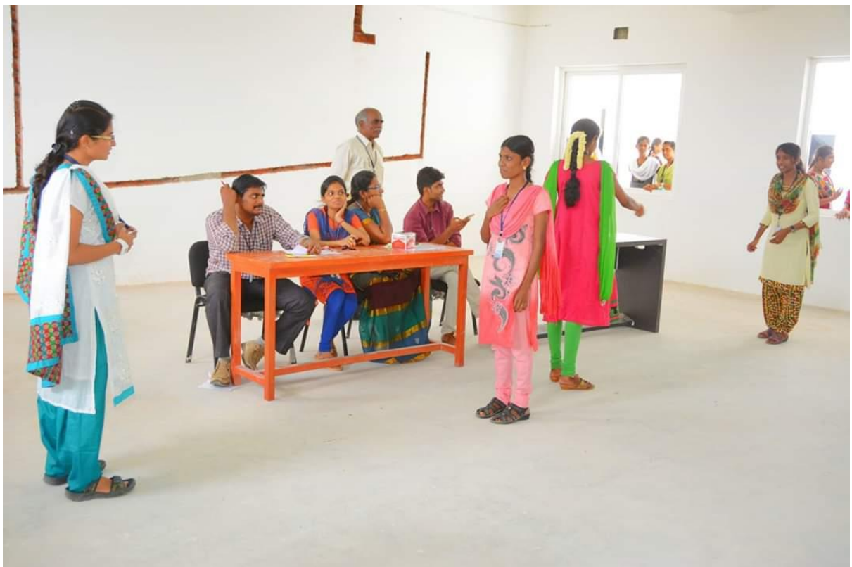
SONY FEST'16-Dumb Charade