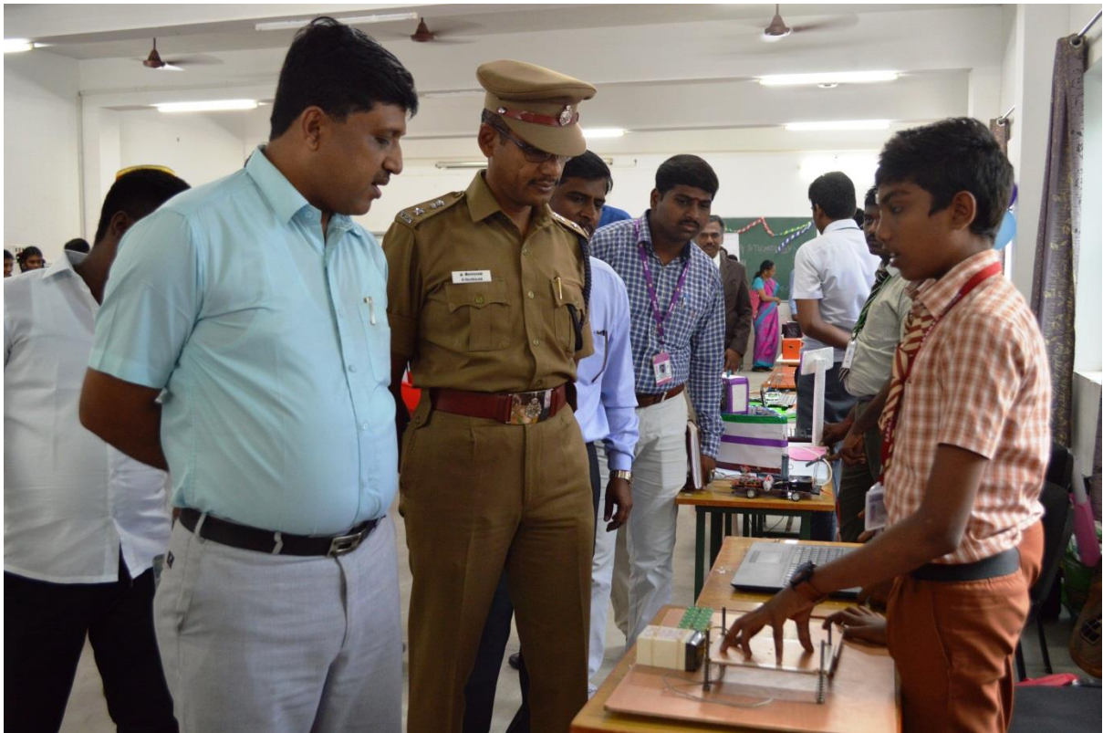
Veettukku Oru Vingnani For School Students