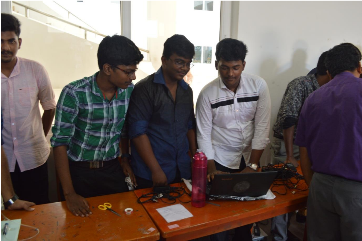
Engineer's Day Celebration