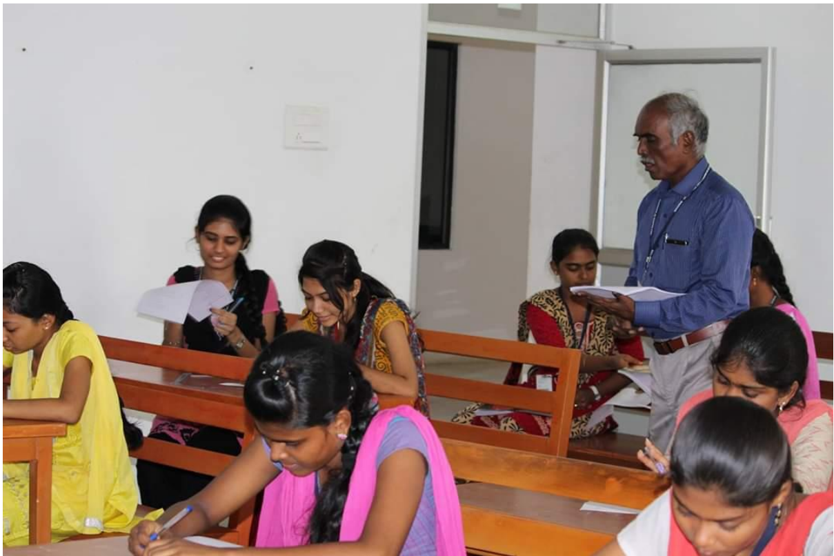
SONY FEST'16-English Essay Writing