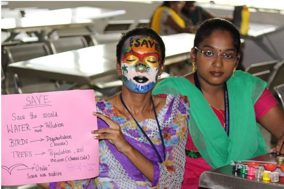
SONY FEST'16-Face Masking