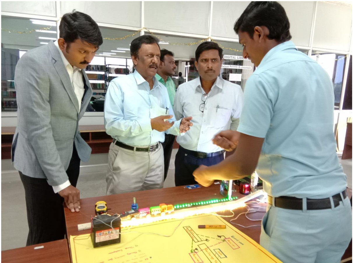
Veettukku Oru Vingnani For Polytechnic Students