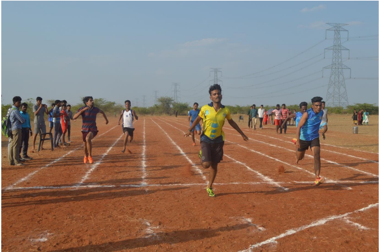
Sports Meet-Field Event-400mts