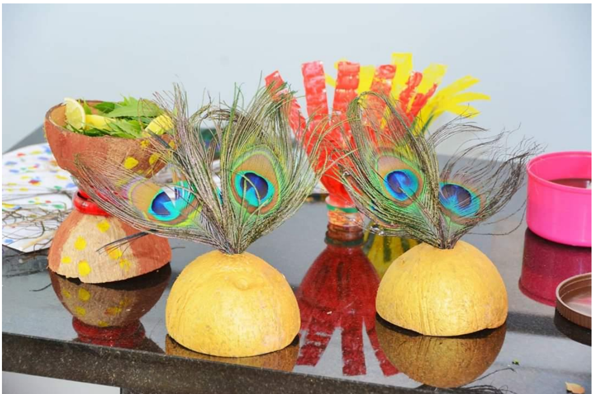
SONY FEST'17-Art From Waste