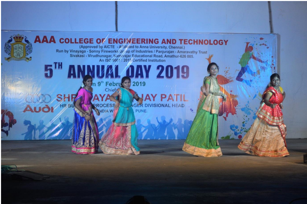
Annual Day celebration