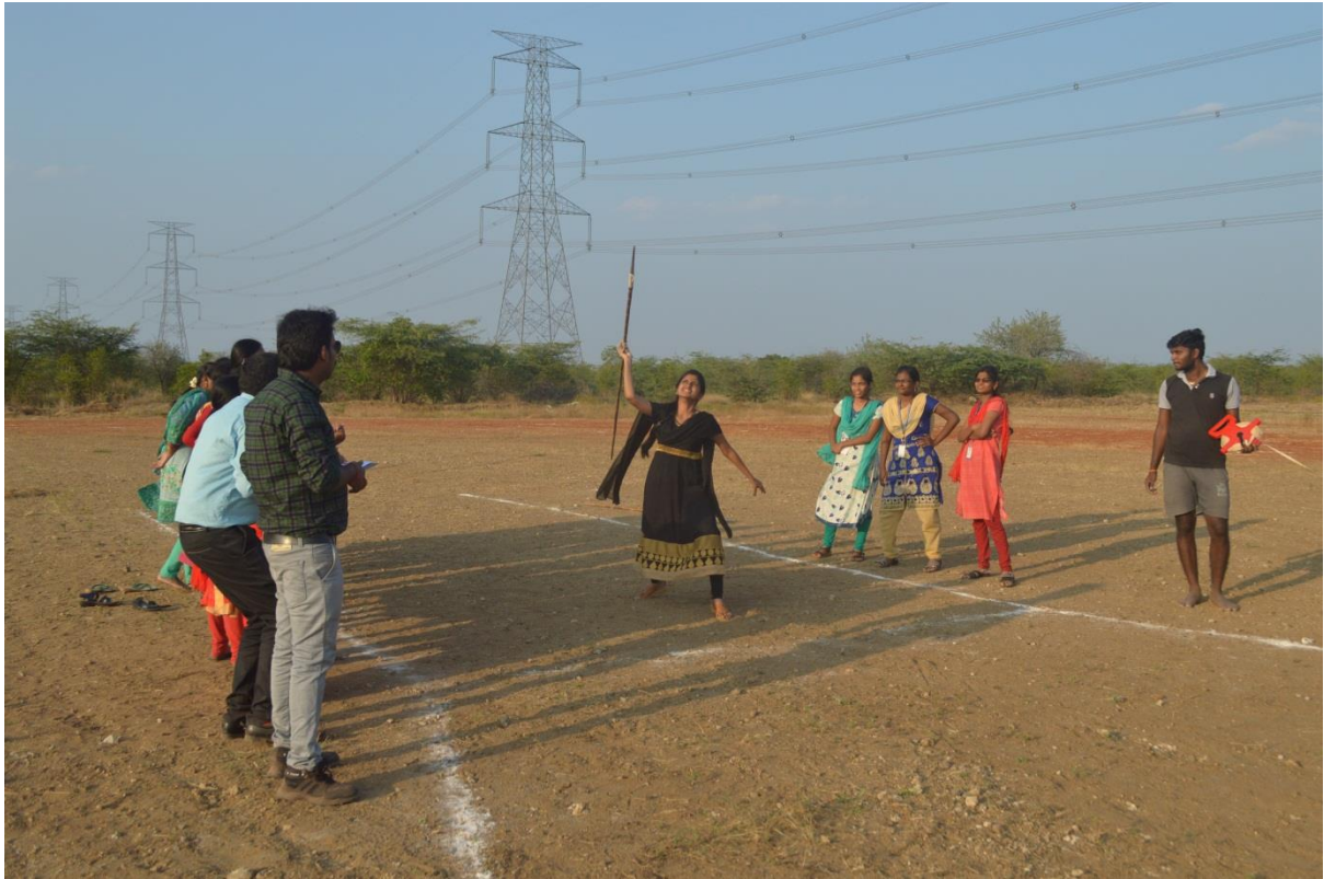
Sports Meet-Javelin throw