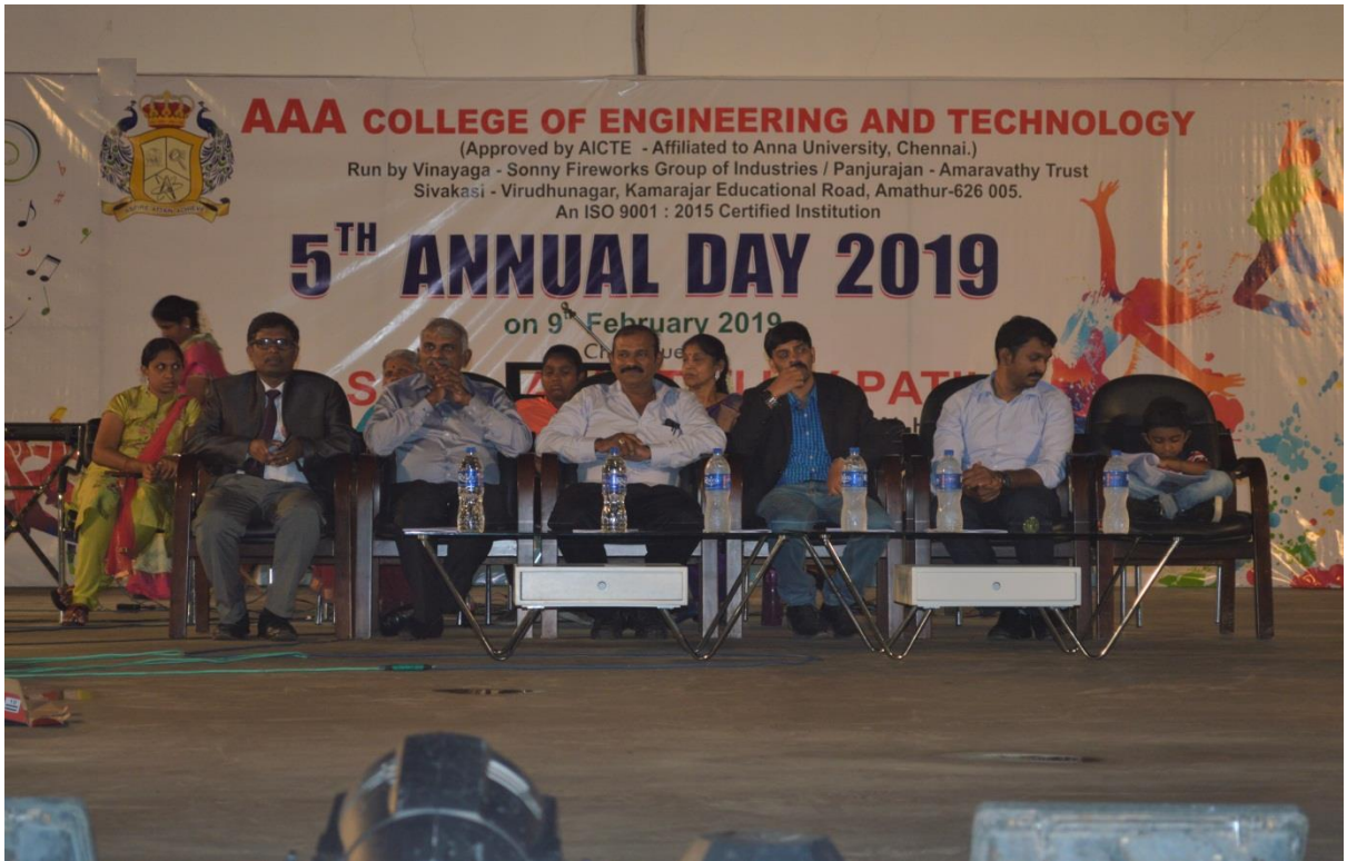
Annual Day celebration