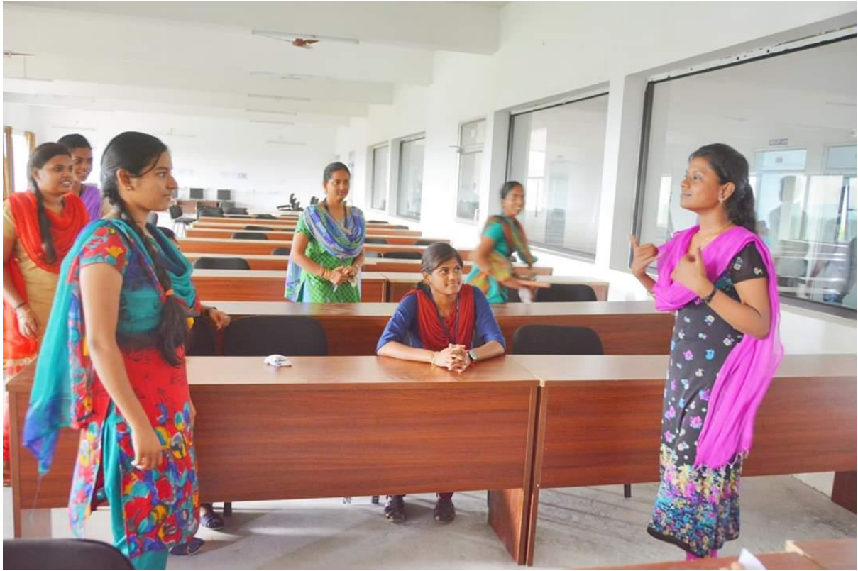
SONY FEST'17-Dumb Charade