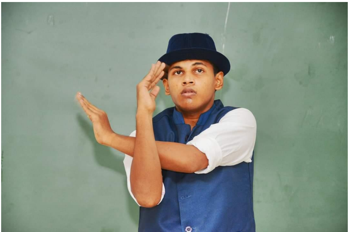
SONY FEST'17-Dance Competition