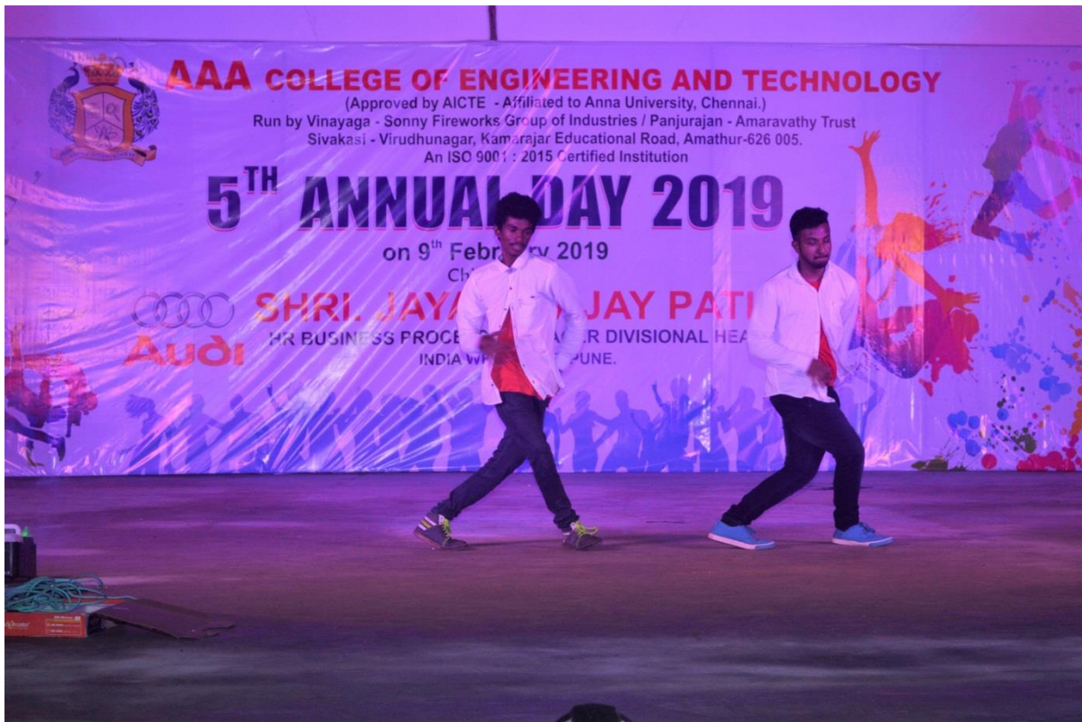
Annual Day celebration