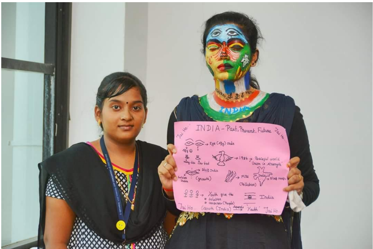
SONY FEST'17-Face Masking