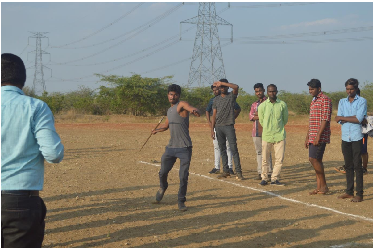
Sports Meet-Javelin throw