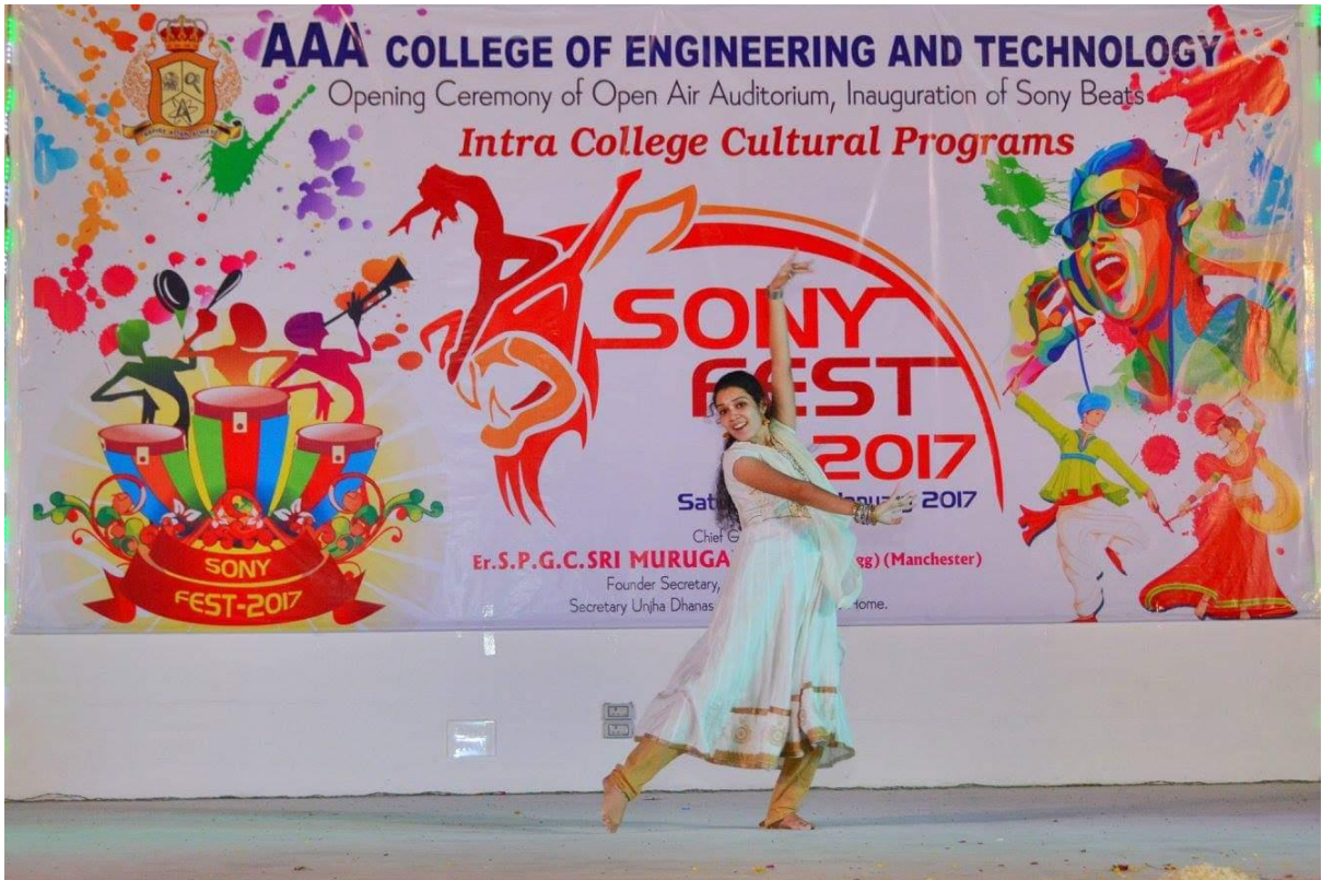
SONY FEST'16-Cultural Program