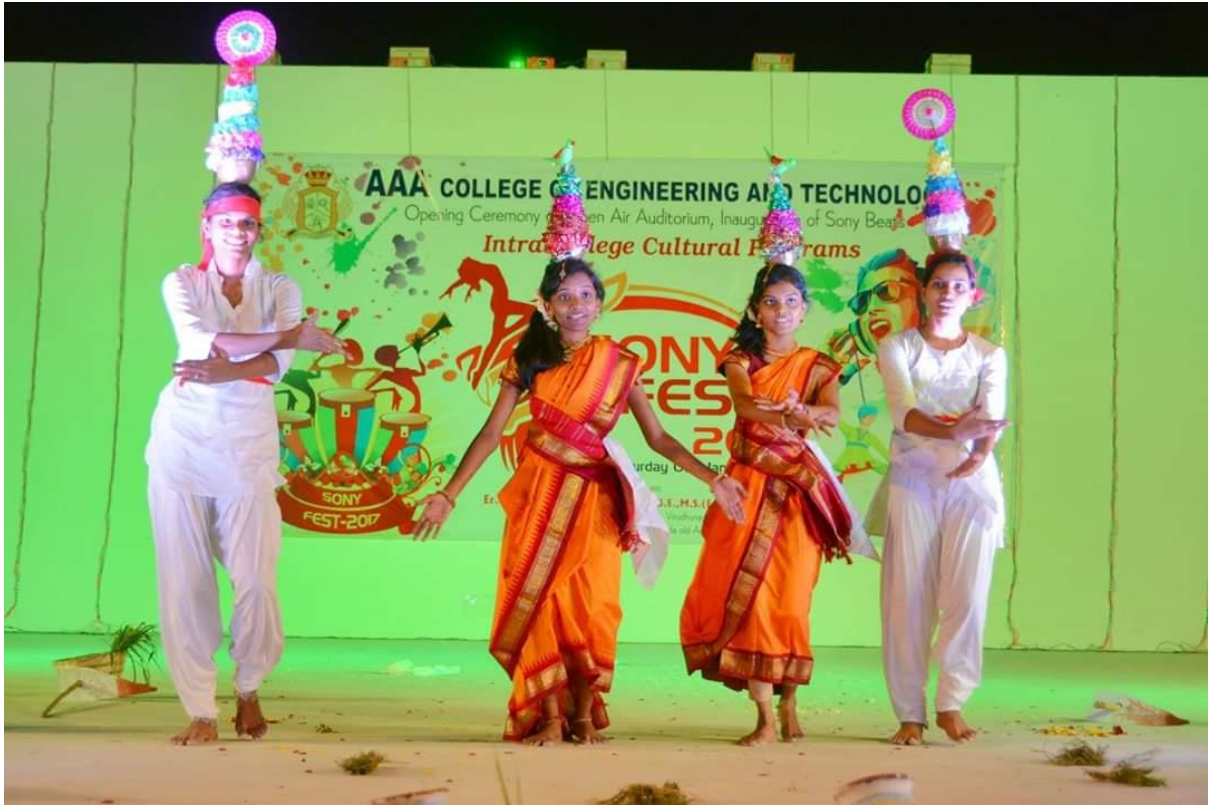
SONY FEST'16-Cultural Program