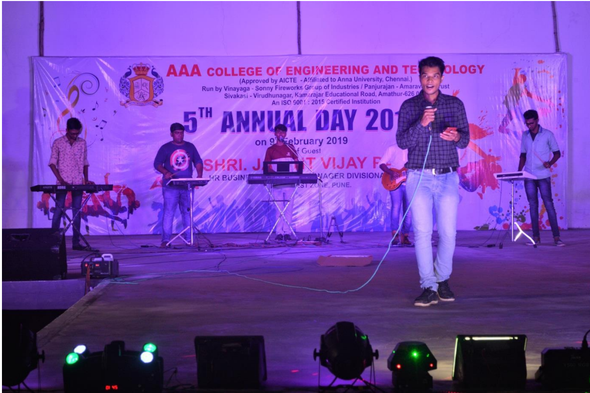
Annual Day celebration