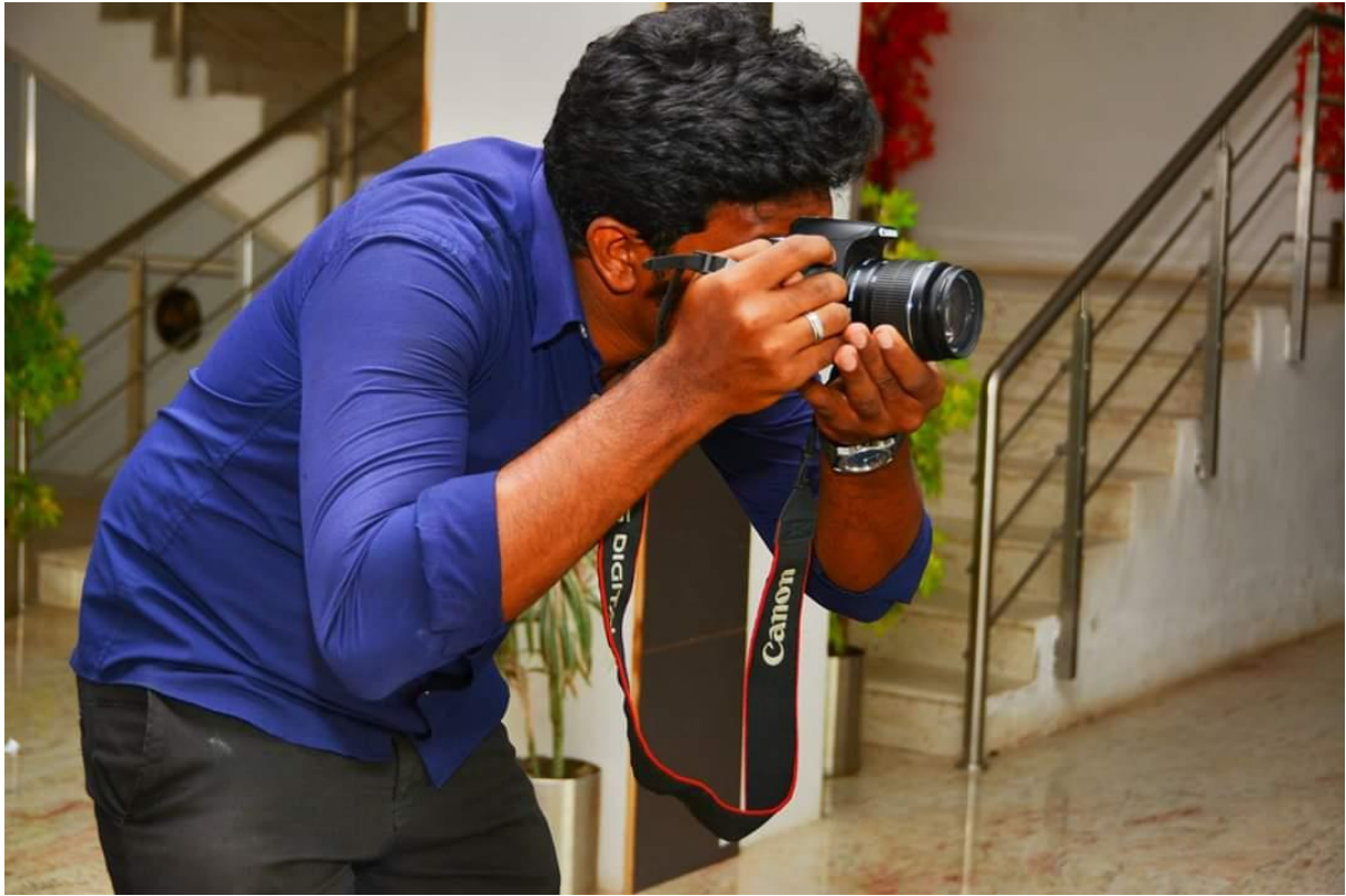
SONY FEST'16-Click This