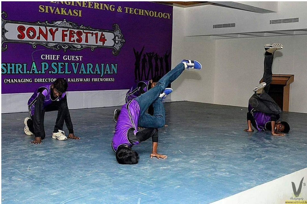
SONY FEST'14-Cultural Program