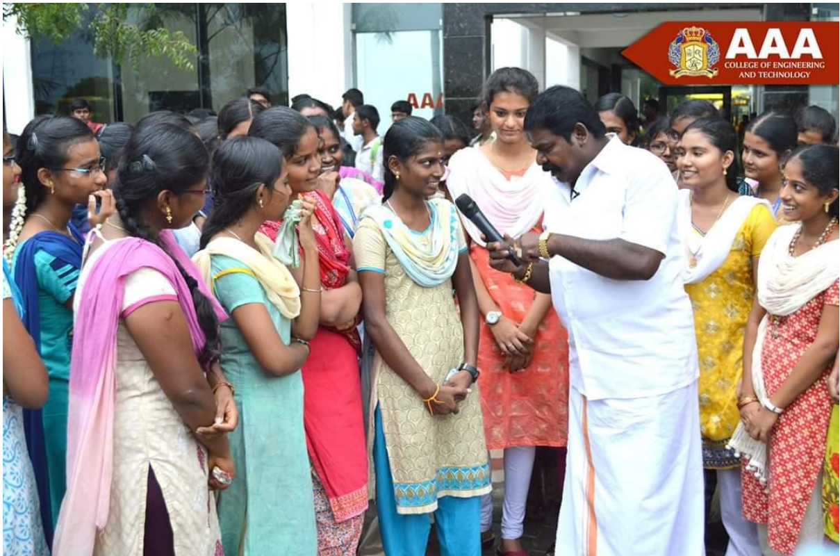
Sollunganne Sollunga program by Sun TV