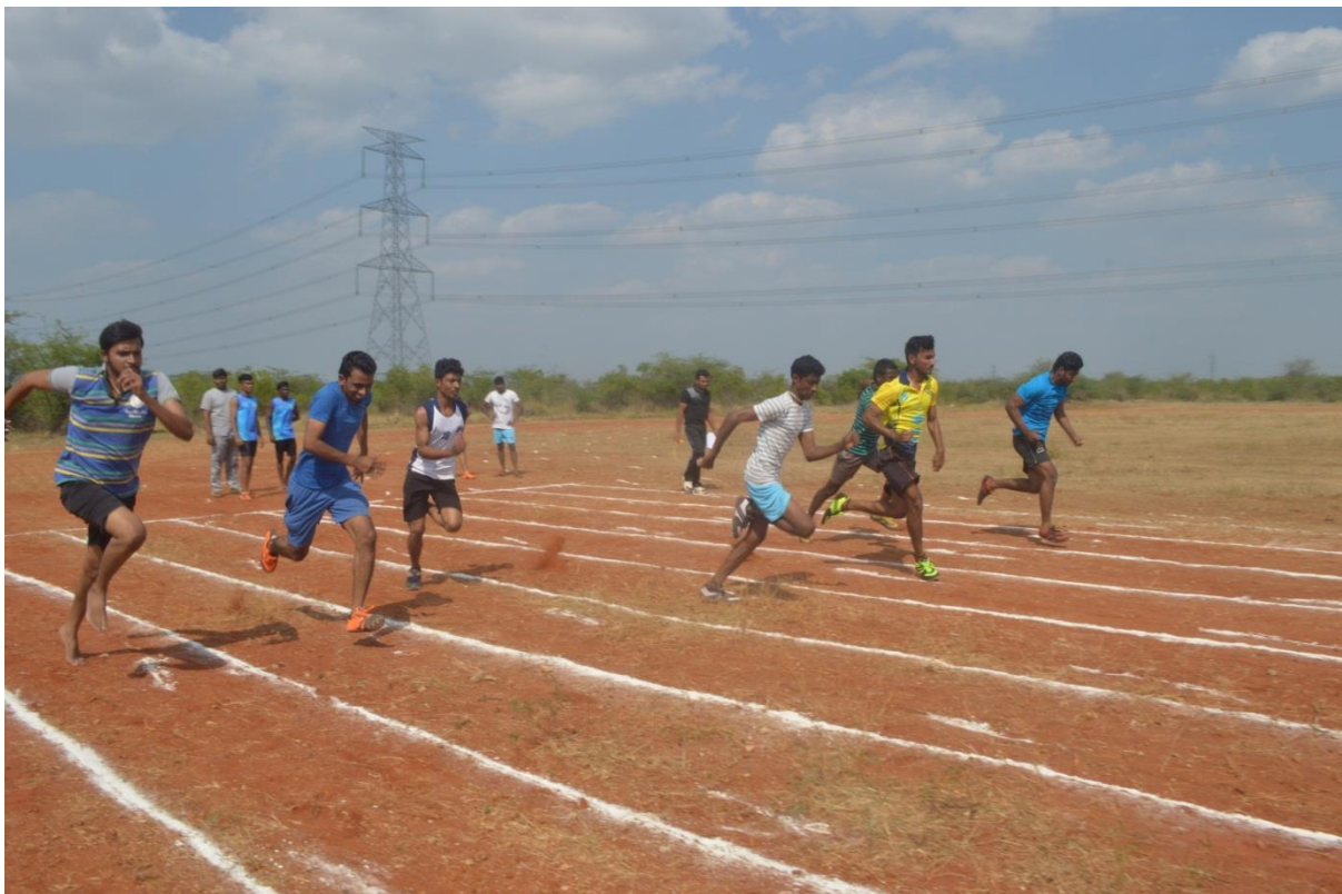
Sports Meet-Field Event-800mts