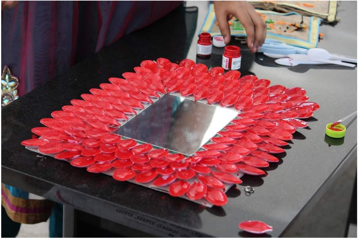
SONY FEST'16-Art From Waste