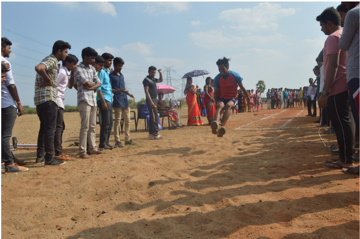
Sports Meet-Long Jump