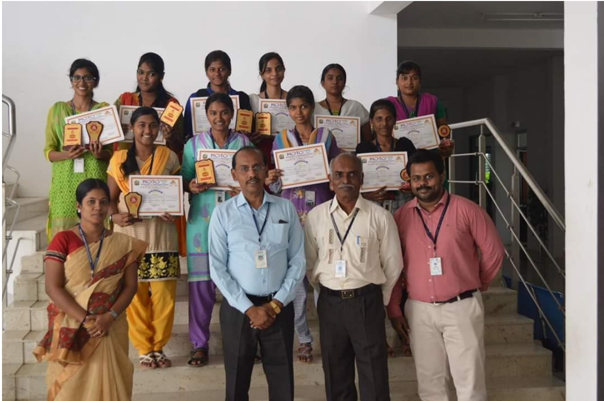
Winners Honoured by Principal Cultural in VHNSN College