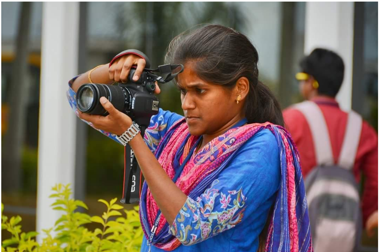
SONY FEST'16-Click This