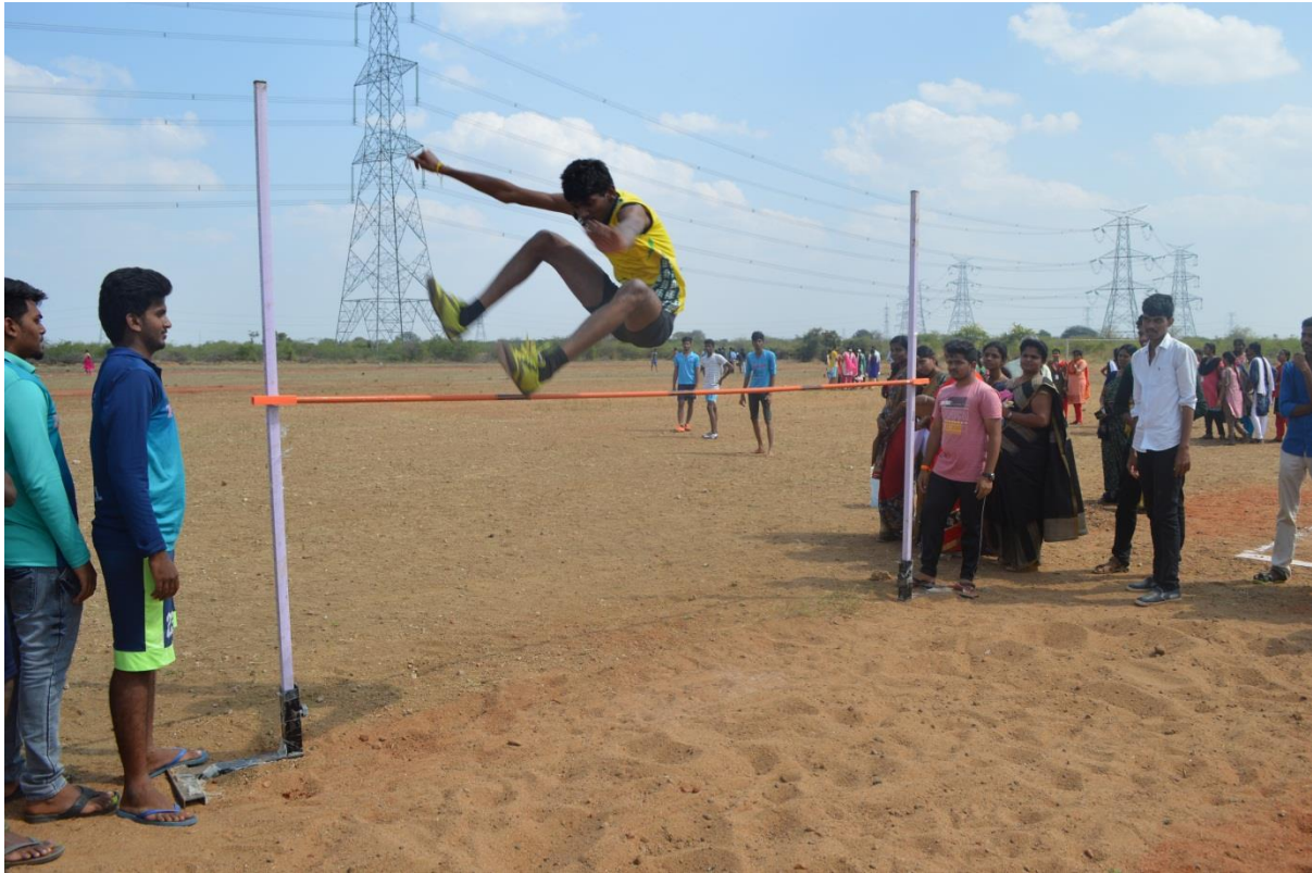
Sports Meet-High Jump