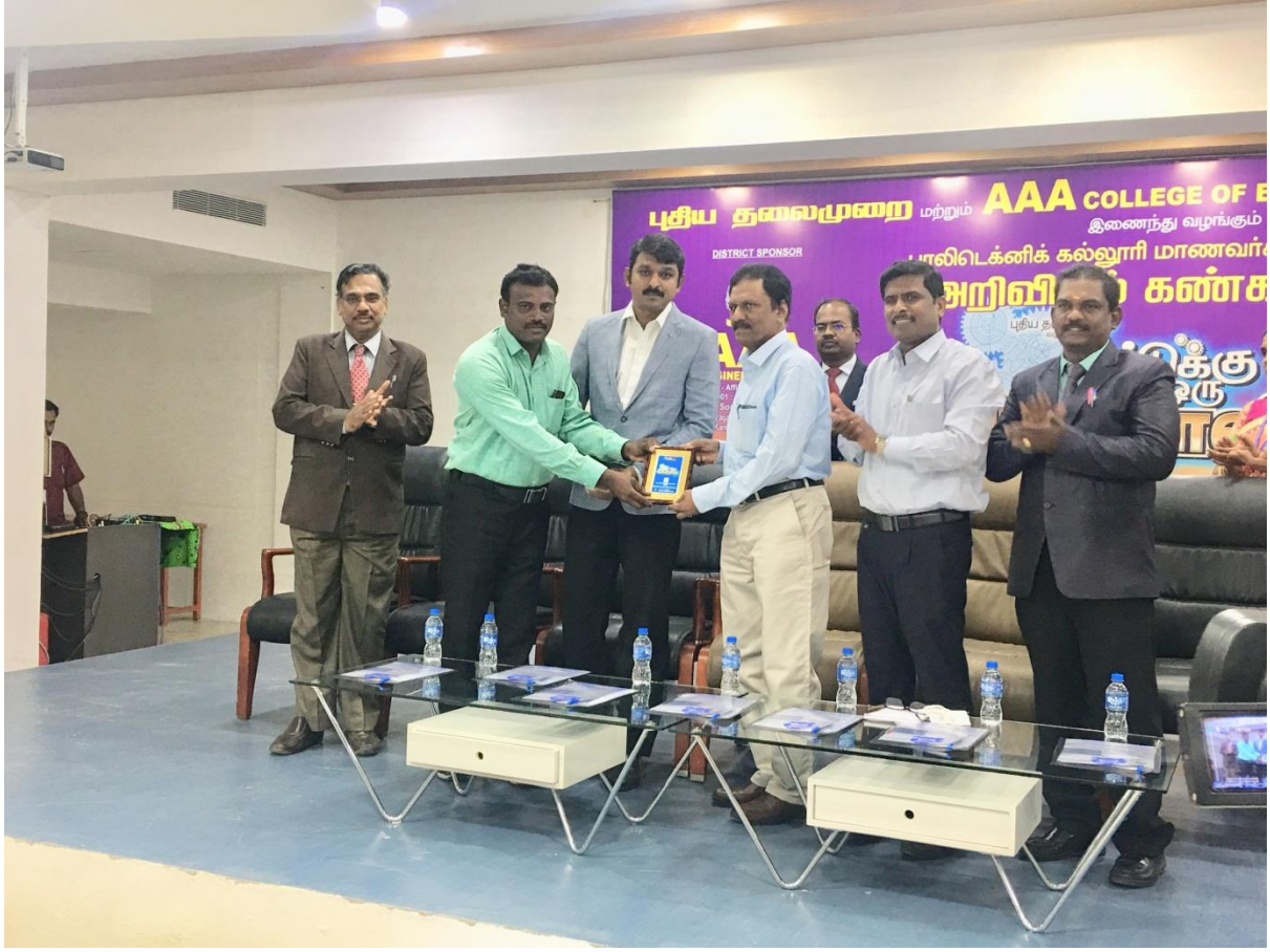
Veettukku Oru Vingnani For Polytechnic Students