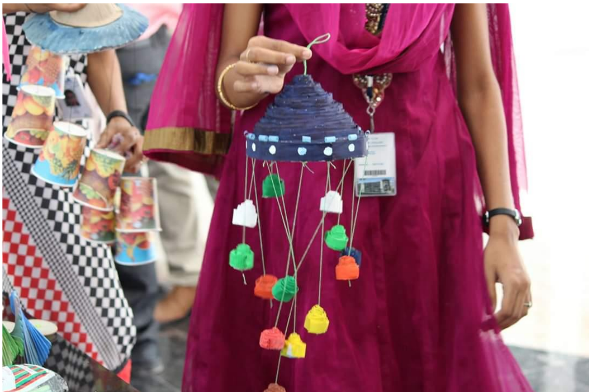
SONY FEST'16-Art from Waste