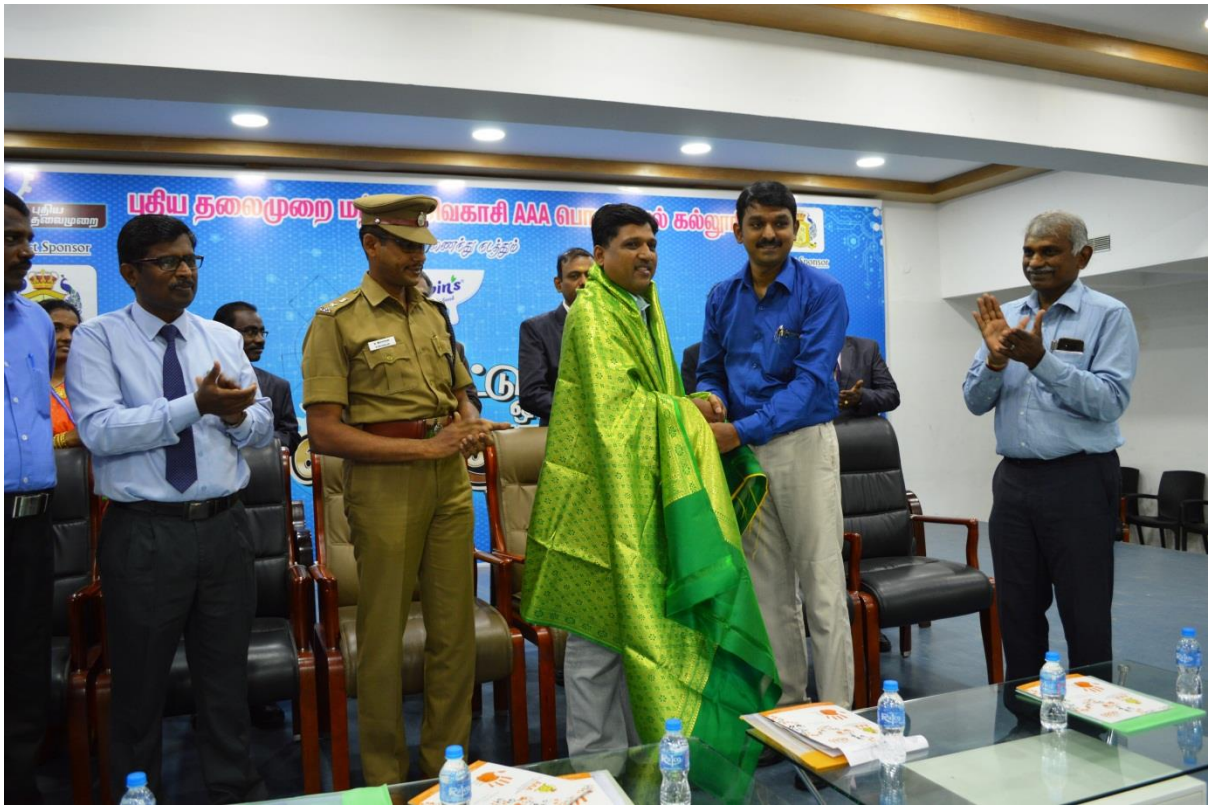
Veettukku Oru Vingnani For School Students