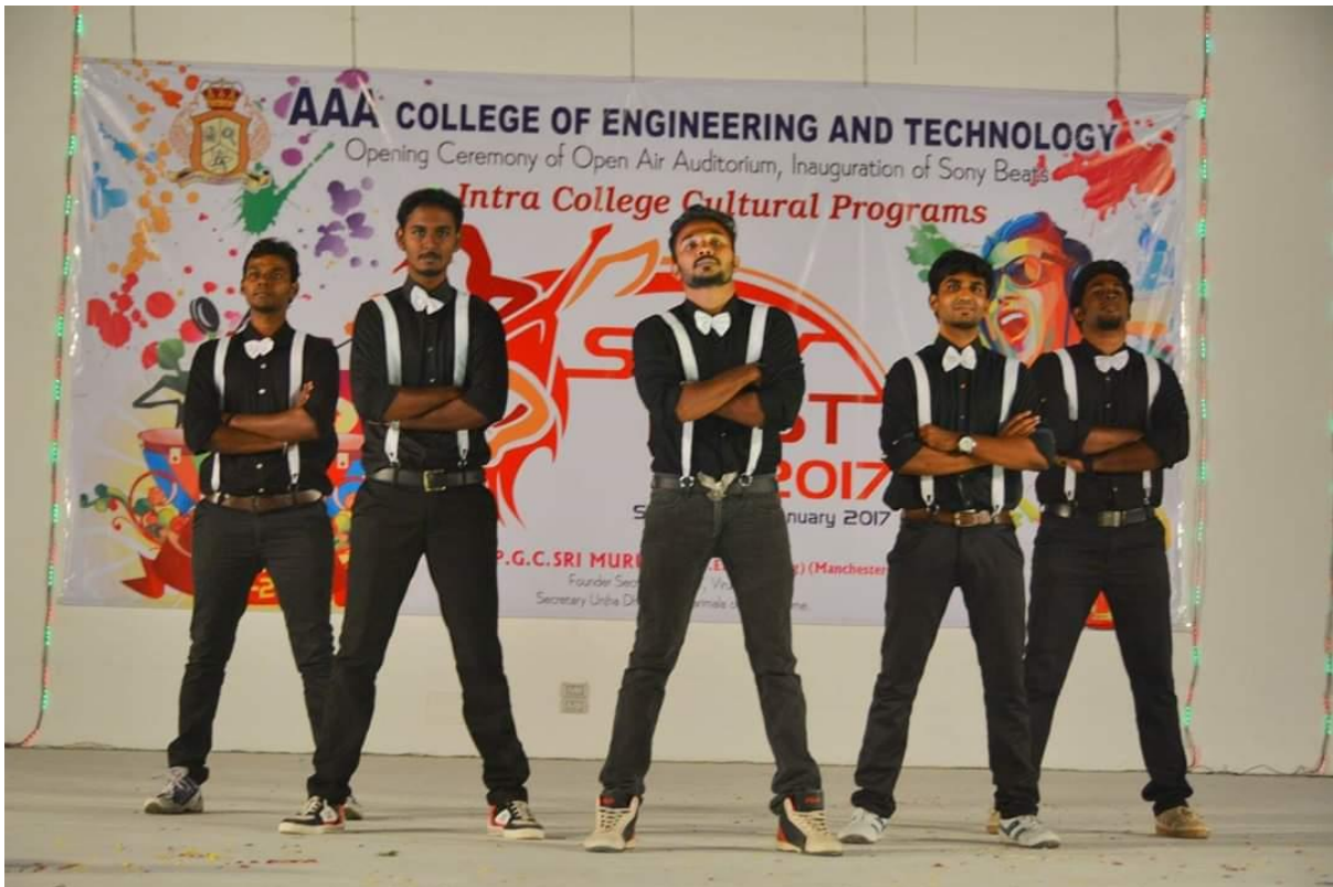
SONY FEST'16-Cultural Program