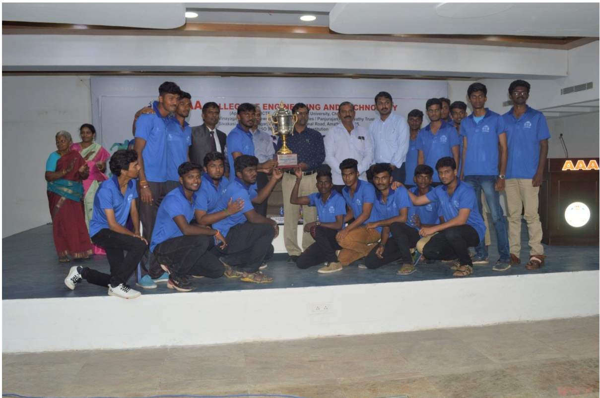
Winners honoured by Chief Guest