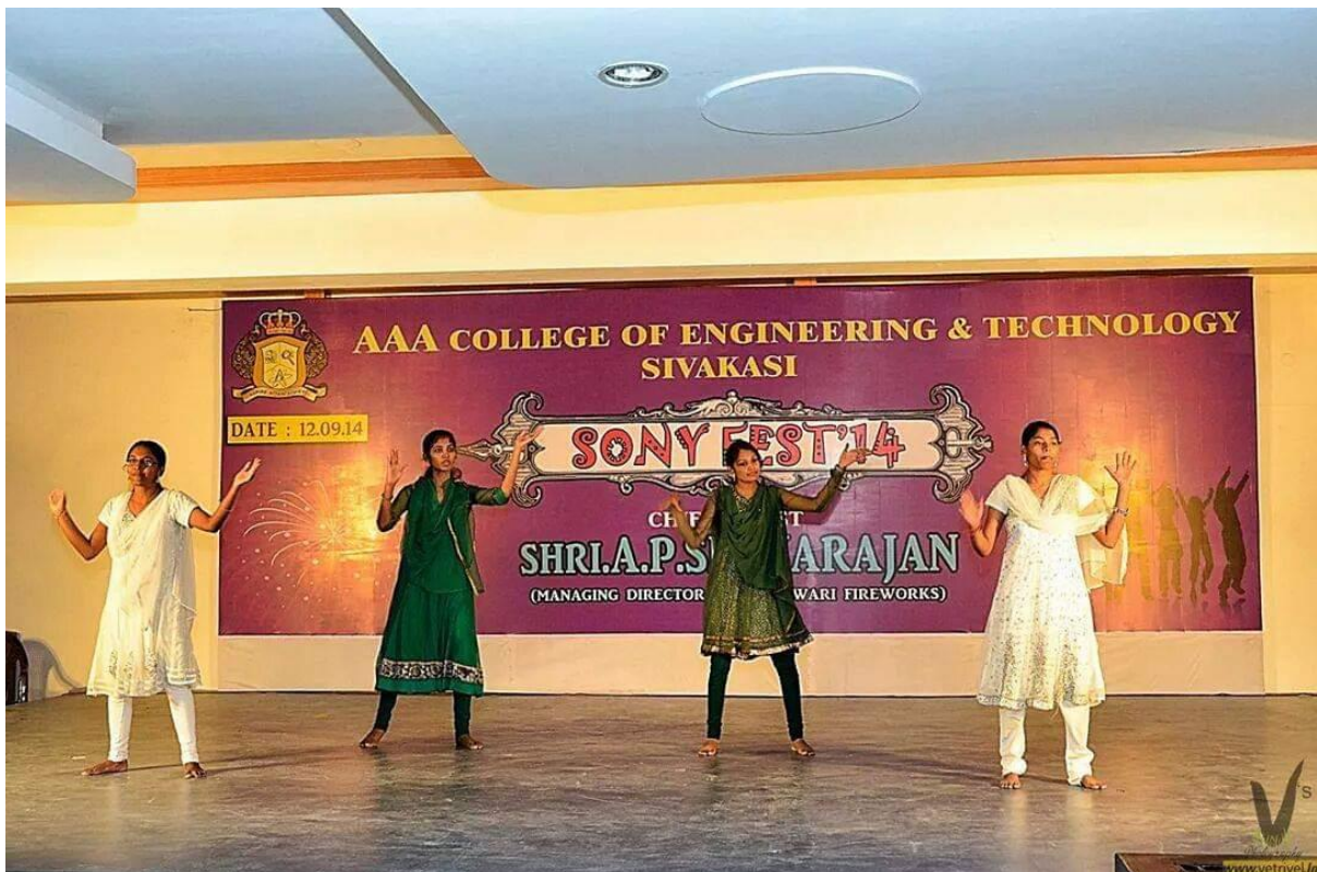
SONY FEST'14-Cultural Program