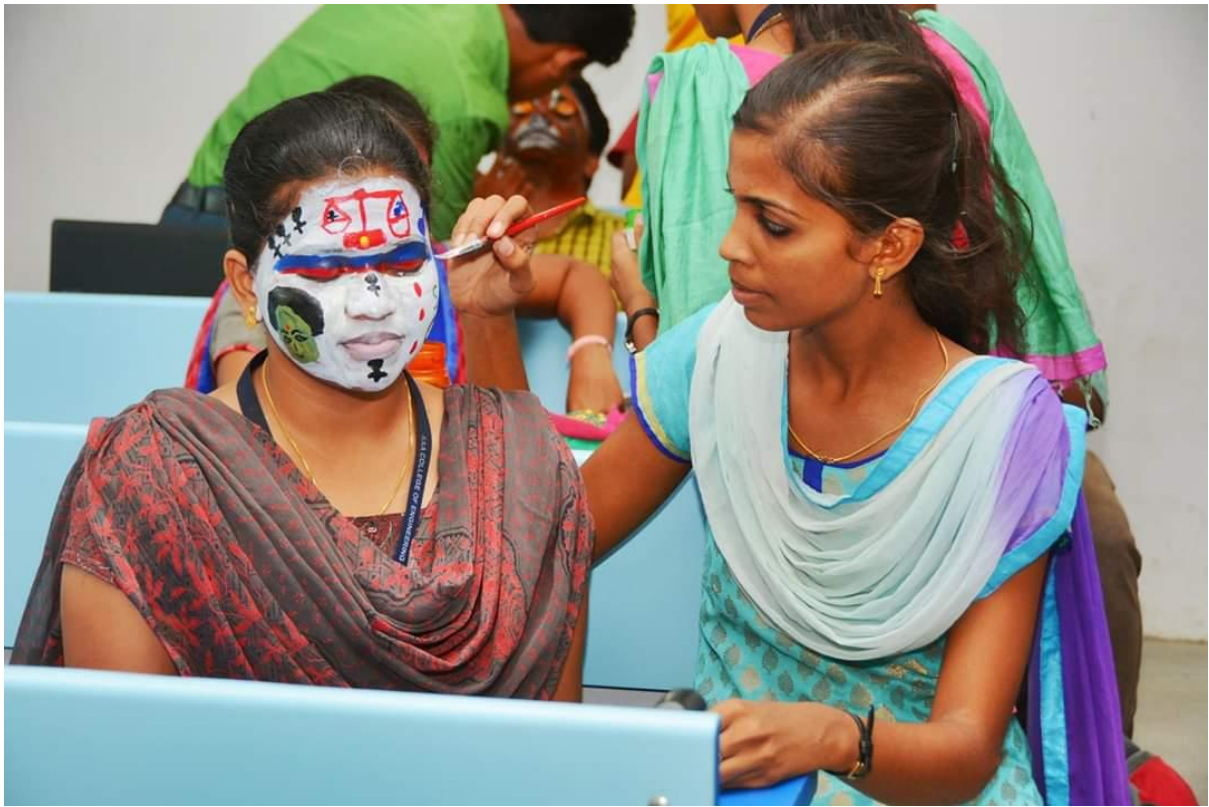
SONY FEST'17-Face Masking