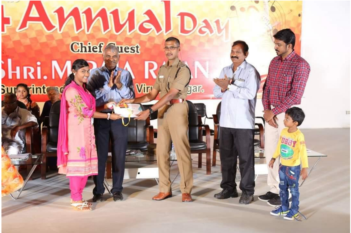
Annual Day Celebration