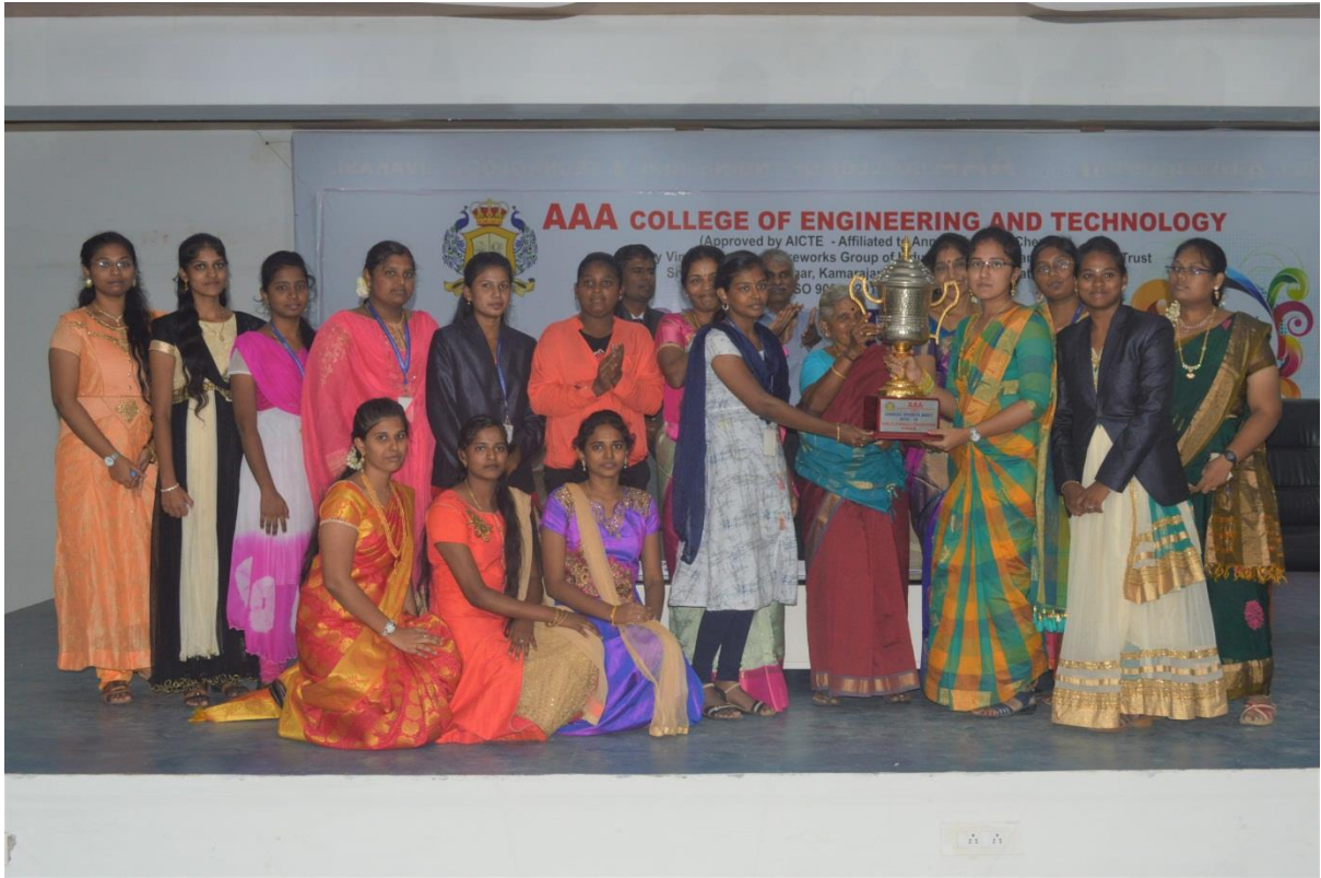
Winners honoured by Chief Guest