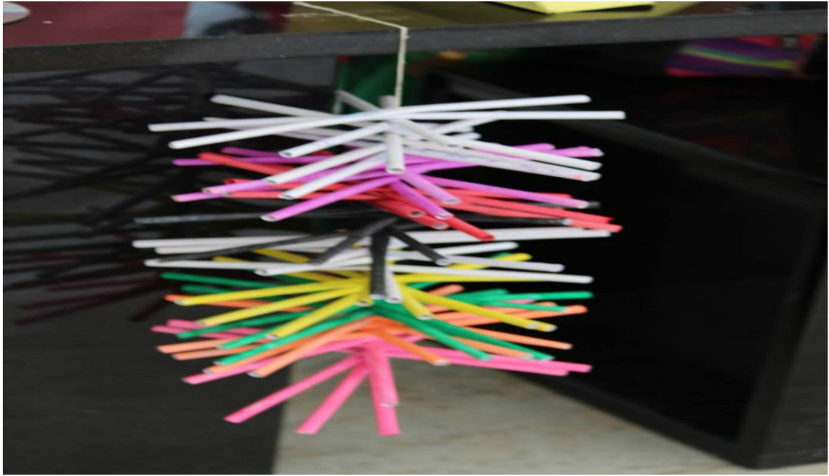
Art from Waste