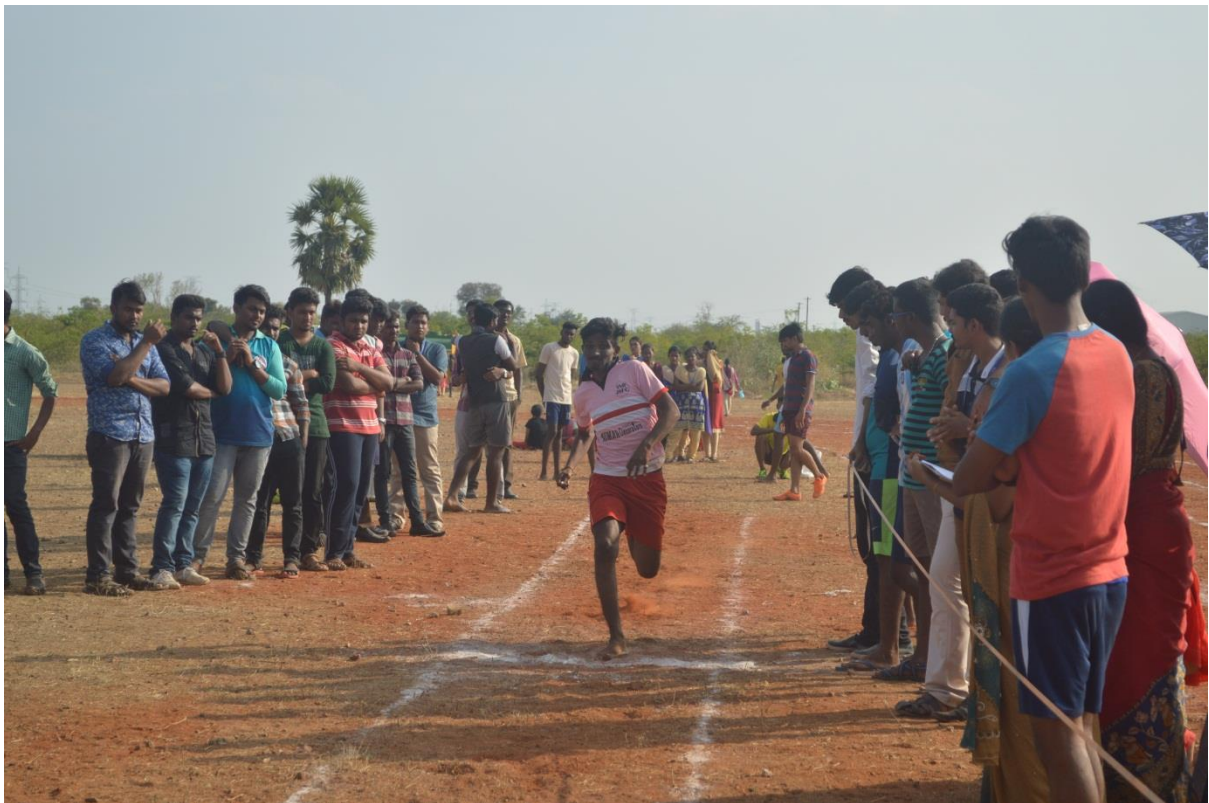
Sports Meet-Long Jump