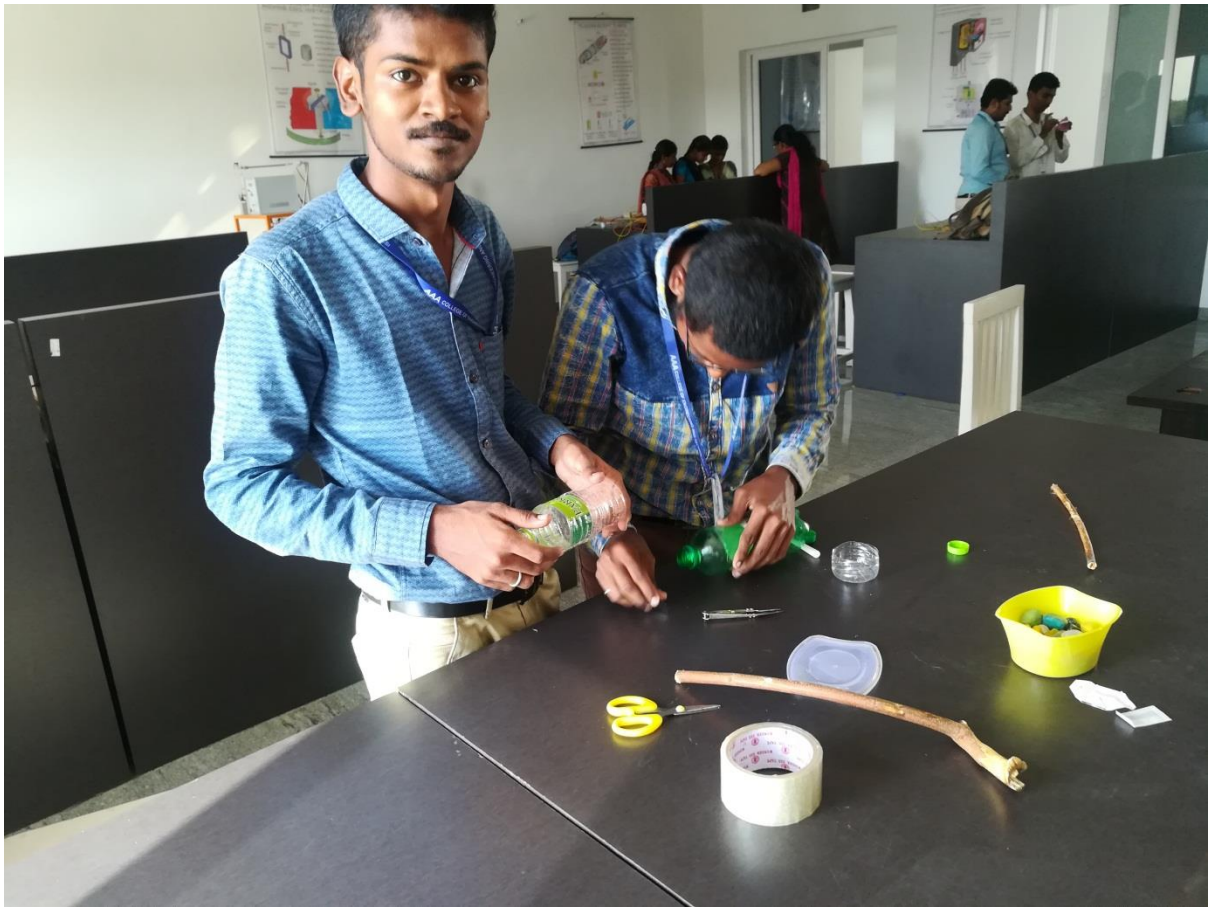
Art From Waste