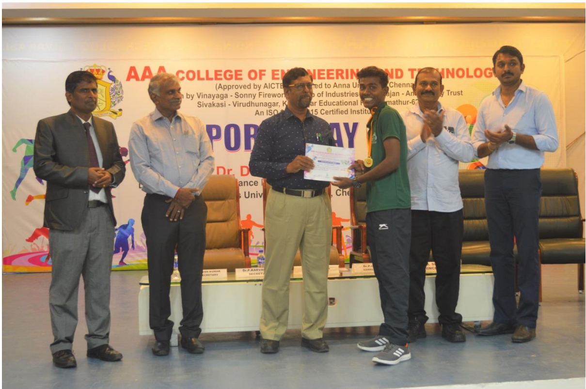
Winner honoured by Chief Guest