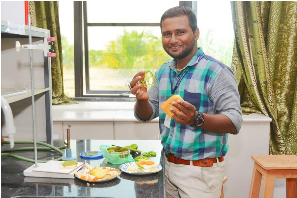
SONY FEST'17-Foodie Wars