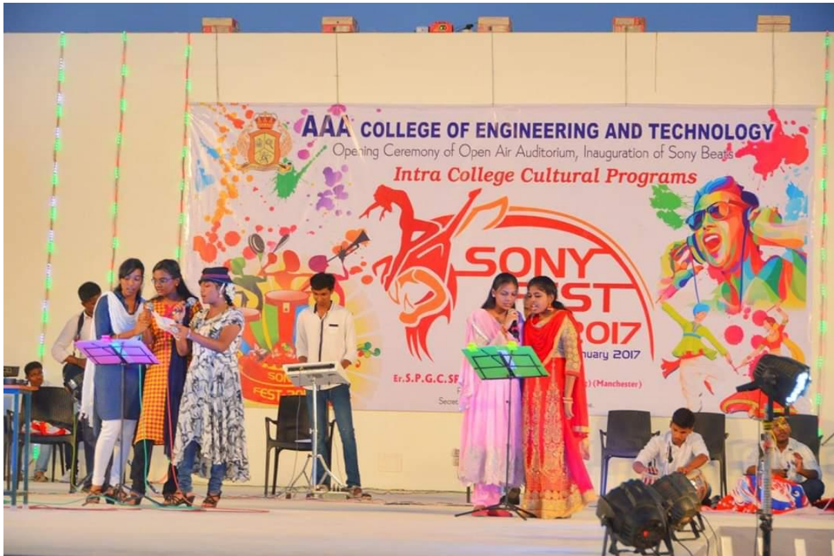
SONY FEST'16-Cultural Program