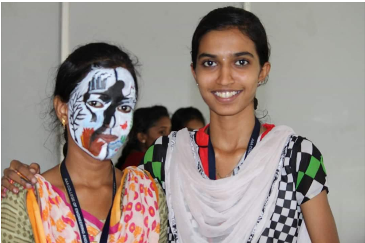
SONY FEST'16-Face Masking