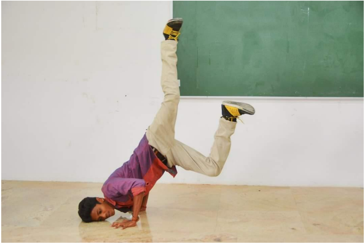
SONY FEST'17-Dance Competition