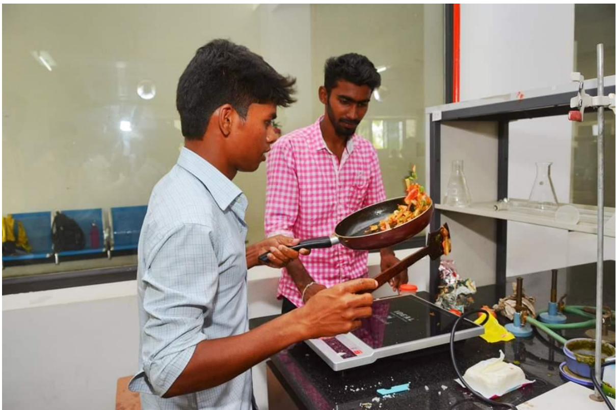
SONY FEST'17-Foodie Wars