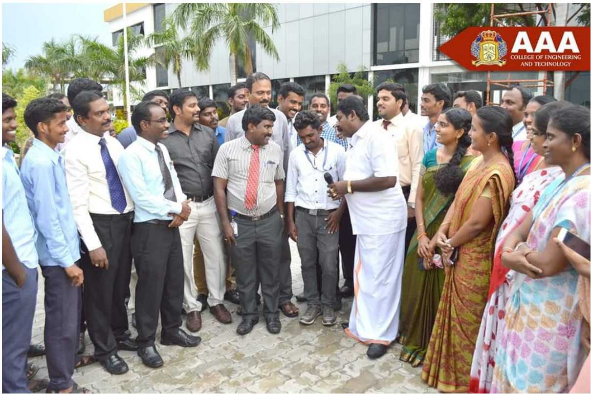
Sollunganne Sollunga program by Sun TV